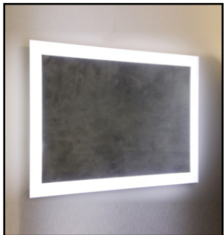
Angel Size: 20"W x 24"H Lumens: 1898 Item#: CVAN2024LED Size: 24"W x 36"H Lumens: 2600 Item#: CVAN2436LED