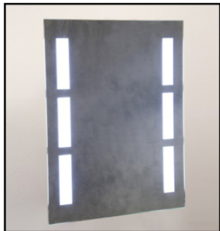
Sally Size: 20"W x 24"H Lumens: 1040 Item#: CVSAL2024LED Size: 24"W x 36"H Lumens: 1560 Item#: CVSAL2436LED