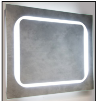
Jamie Size: 32"W x 24"H Lumens: 2158 Item#: CVJA2432LED