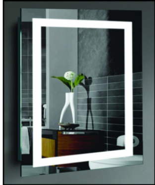
Malisa Size: 20"W x 24"H Lumens: 1898 Item#: CVMA2024LED Size: 24"W x 36"H Lumens: 2600 Item#: CVMA2436LED