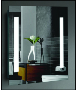
Alex Size: 20"W x 24"H Lumens: 1040 Item#: CVAL2024LED Size: 24"W x 36"H Lumens: 1560 Item#: CVAL2436LED