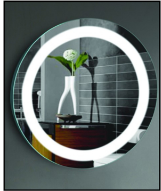
Ilana Size: 24" Round Lumens: 520 Item#: CVIL24LED