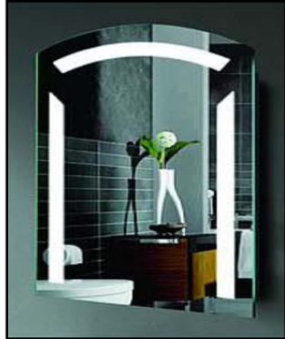
Sara Size: 20"W x 24"H Lumens: 936 Item#: CVSAR2024LED Size: 24"W x 36"H Lumens: 1456 Item#: CVSAR2436LED