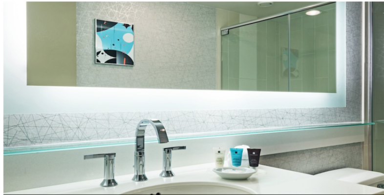
Crowne Plaza Seattle

Artline Group 1 Midland Ave Hicksville, NY 11801 www.artlinegroup.com help@artlinegroup.com